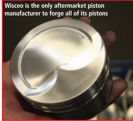
Wiseco is the only aftermarket piston manufacturer to forge all of its pistons

The cross-over between developing pistons for racing use and then taking that knowledge and applying it to street applications can be seen with the materials used in Wiseco’s Harley-Davidson pistons. The company uses the same 2000 series aluminum alloy for H-D pistons as it does for all its race applications. This is done because of that particular alloy’s ability to withstand high temperature environments, being air-cooled Harleys run at higher temperatures than most other contemporary street bikes and so benefit from the superior high temperature strength of the material used for the pistons.