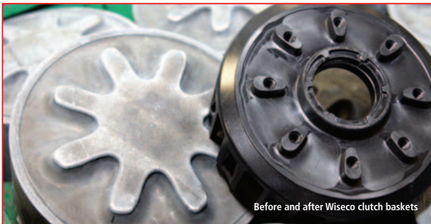
Before and after Wiseco clutch baskets