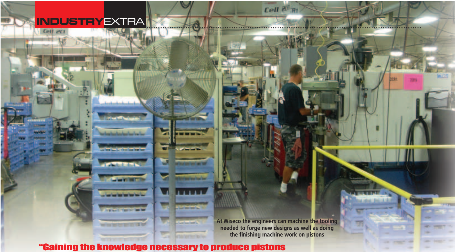
At Wiseco the engineers can machine the tooling needed to forge new designs as well as doing the finishing machine work on pistons